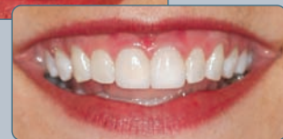
Smile makeover with whitening and 2 porcelain restorations