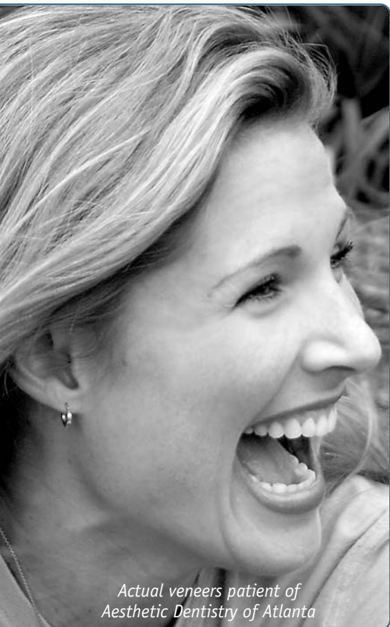
Actual veneers patient of Aesthetic Dentistry of Atlanta

When asked what makes another person attractive, people commonly answer, "a great smile." People with great smiles exude confidence, while people with a smile problem tend to be self-conscious. For example, a person might have a dark tooth or spaces between teeth. Problems like these have negative effects on a person's self-esteem. Without realizing it, people will alter the way they smile or stop smiling altogether to hide the smile problem. Yet, through whitening and a couple of restorations this patient suddenly has a beautiful white smile along with newly found confidence.