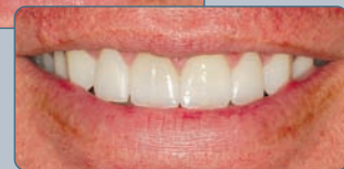
Smile makeover with porcelain veneers