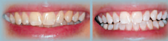
Actual Patient before and after Zoom! Whitening

Patients of Aesthetic Dentistry of Atlanta get dramatic results with simple, conservative procedures such as minor tooth movement, whitening, direct bonding, enamel contouring, thin veneers or a combination of these. Drs. Boulden and Goode offer an array of services for their patients such as thin porcelain veneers including Lumineers™, Invisalign®, in-office whitening with Zoom!®, implants, and general dentistry (including porcelain inlays and onlays). The doctors are also experienced in posterior rejuvenation (replacement of failing silver fillings and cavities in back teeth with conservative inlays or onlays instead of crowns). "Our emphasis is on conservative cosmetic care and we choose to also provide general dentistry services. Many desire a beautiful new smile, and everyone needs a dentist."